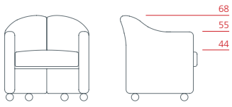
Armchair on castors 1PS6011: L 68 D 60 H 68