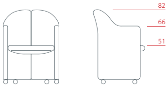
Tall armchair on castors 1PS6021: L 57 D 56 H 82